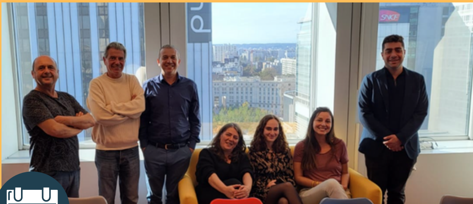
Project Meeting, Paris, October 25th